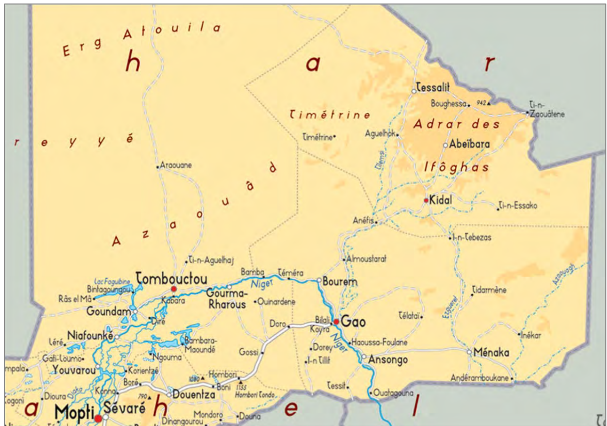
Figure 2. Map: Enlarged view of northern Mali taken from Figure 1